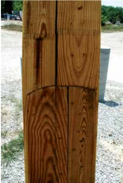
Photo A – Typical unglued edge joint on cut side of pole showing slight checking through thin area of next layup.