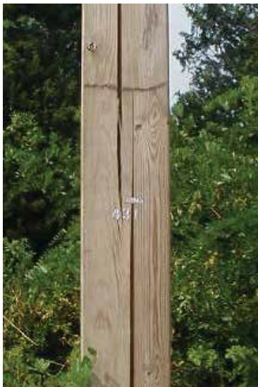
Photo C – Typical unglued edge joint on cut side of pole showing checking through thin area of next layup. Wood treated with CCA is more susceptible to deep checking than wood treated with Oil Borne Preservative.