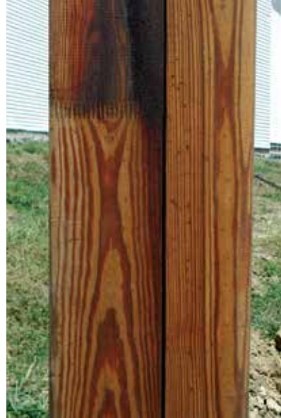
Photo B – Typical unglued edge joint on uncut side of pole which runs the entire length of pole.