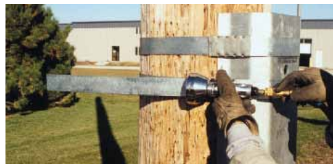
Cut excess Banding off next to Seal using Air Cutter or by bending back & forth with Tensioner still attached.†

Repeat steps 4 through 14 for all bands.