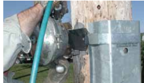
Apply 4 crimps to the Seal using either an Air or Manual Crimper.†