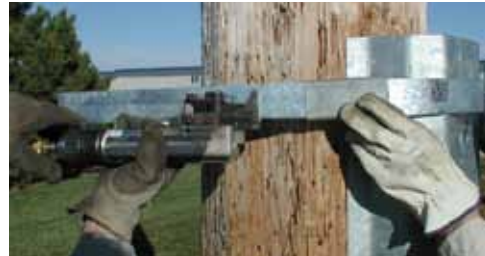
Tension the Banding using either an Air or Manual Tensioner.† Hit Banding with hammer to help tensioning.