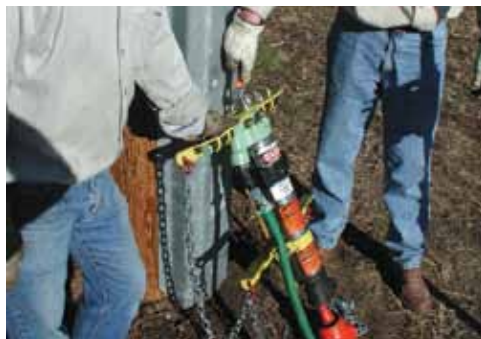
Attach winch line to Hammer Assembly.