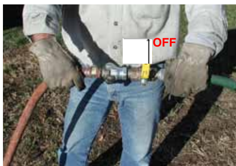
Connect air supply hose to the inline safety valve. Valve should be in the OFF position (See caution note).