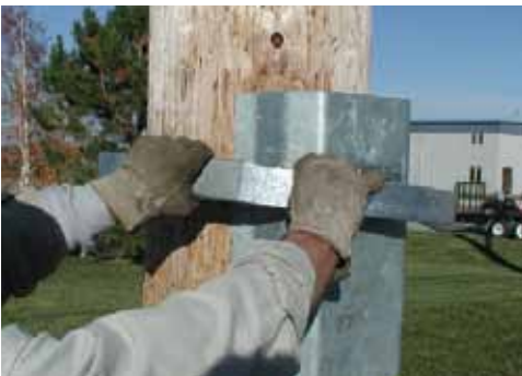
Wrap Banding around pole / steel and slide the uncurled end through Seal as shown.