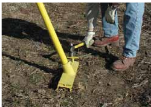
Secure Winch Pole Assembly base by driving two “T” Pins into the ground.