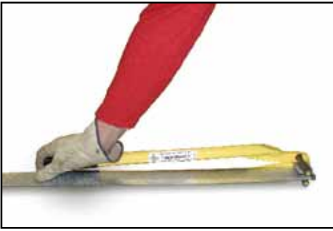
Curl band by completely closing the tool.