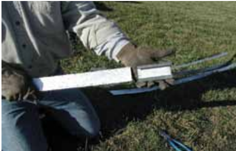
Slide a Seal onto a piece of Banding.