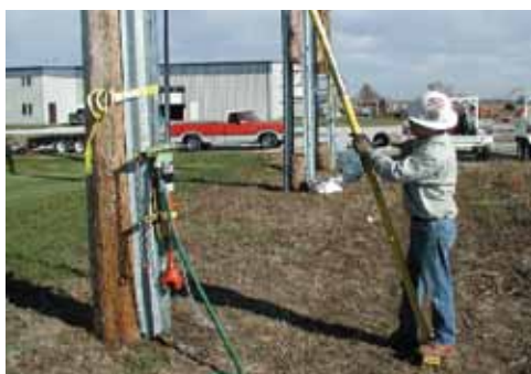
Raise Hammer Assembly approximately 3 feet.