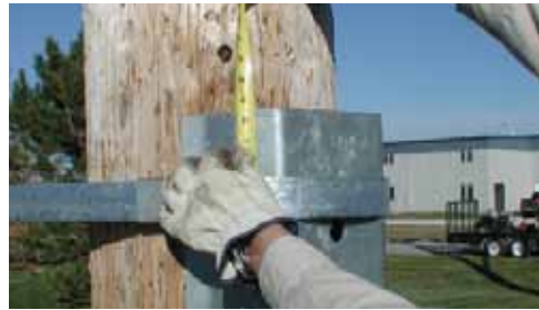
Position Banding 2" to 4" from top of steel.