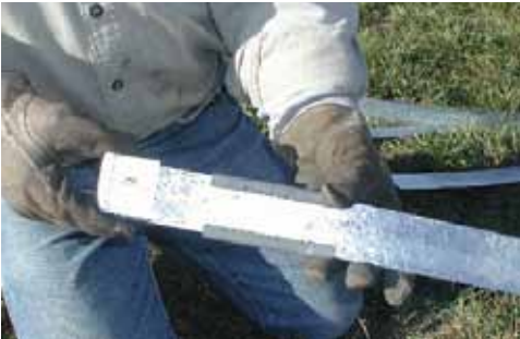
Make sure the Seal is oriented as shown, with the open side toward the curl.